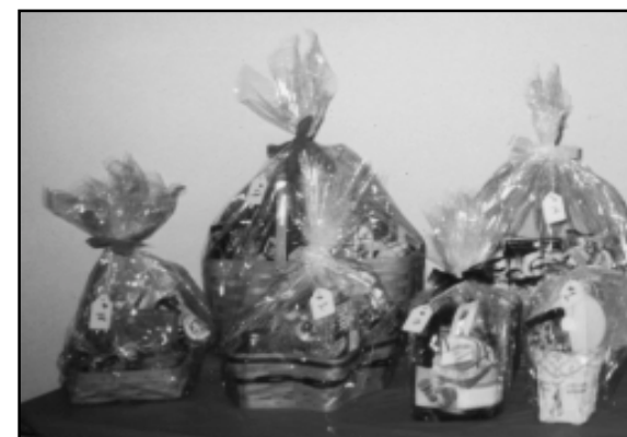
"Just a few of the lovely baskets that were up for grabs"